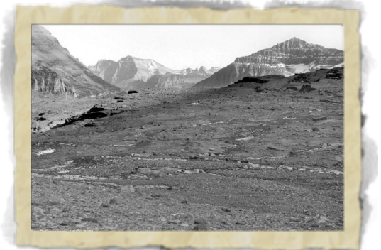
Boulder Glacier, Glacier National Park Jerry DeSanto 1988