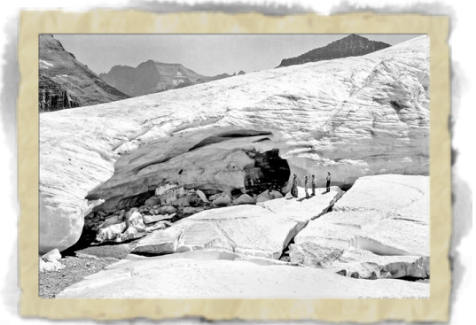
Boulder Glacier, Glacier National Park G. Grant 1932