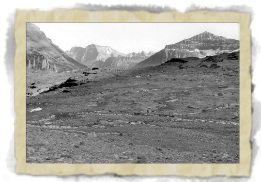
Boulder Glacier, Glacier National Park Jerry DeSanto 1988