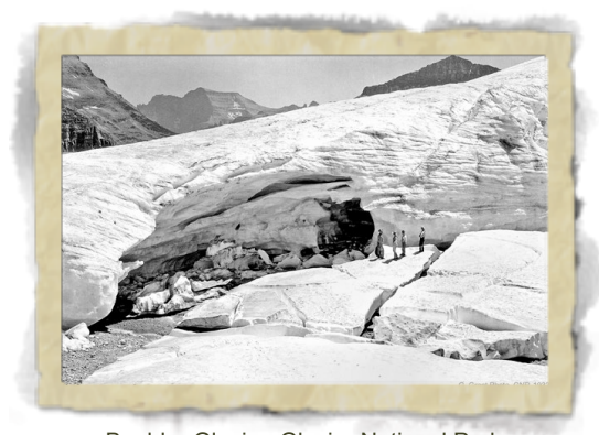
Boulder Glacier, Glacier National Park

American society, indeed the entire world, is failing to rise to this formidable challenge. Yet conservation groups and educators across Montana are taking important steps to address climate change. To further encourage such efforts, the Cinnabar Foundation will prioritize grants to non-profit organizations and projects in 2011 that address one or more aspects of climate change, including: