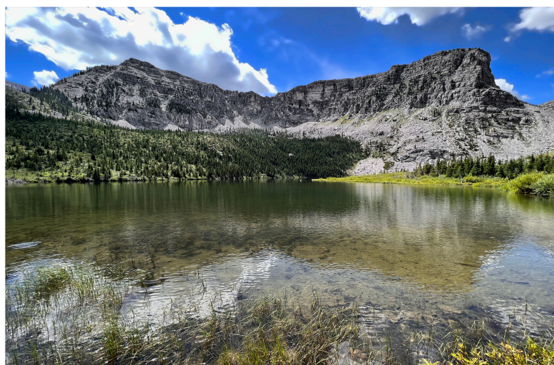
Kiyo Crag Lake in the Badger-Two Medicine

This year has already been incredibly impactful. Thus far, we've awarded $430,500 through 64 competitive grants and awards. On the next page is a breakdown by conservation funding priority. You can also read more here .