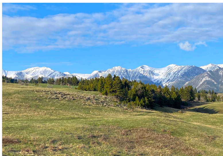
Absaroka Range – May 2022

This year, Cinnabar thus far has awarded 60 grants and two awards totaling $456,000 – and it's still summer! Read more here .