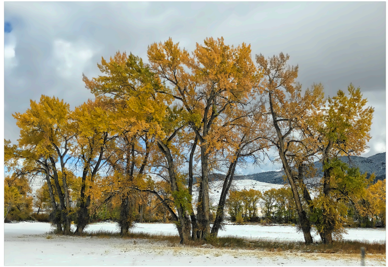
Absaroka Range – May 2022

Thanks to the generosity of our annual donors and the far-sighted philanthropy of Legacy Society members, in 2022 Cinnabar awarded 65 grants and six awards totaling $502,000. Our grantees leveraged this amount to over $1million to directly support conservation in this region.